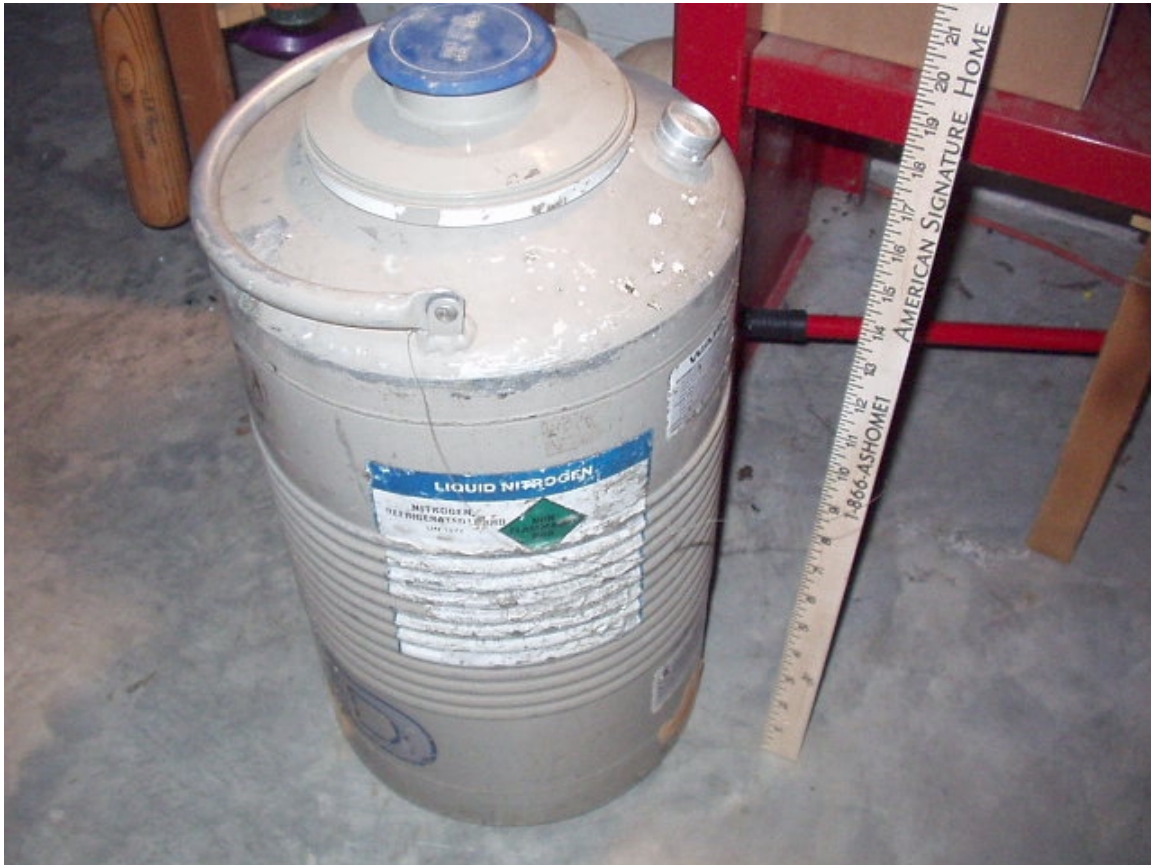
Figure 1. A 10 liter LN 2 container from Airgas (931-645-8276) in Clarksville, TN. As the LN 2 warms, it changes back into the gas state. The loose fitting top prevents explosion. The LN 2 lasts a surprisingly long time (several days) in this type/size container.

With these superconductor kits, you can check the conductance of the YBCO disk with a common continuity meter at room temperature to verify that it is, in fact, an insulator. Once cooled with LN 2 , you can check the continuity of the YBCO disk again to verify that it has now turned into a conductor. You can also experiment with the unusual characteristics of superconductors such as the Meissner effect and the zero resistance effect.