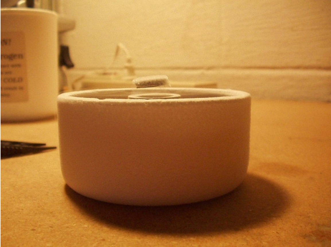
Figure 3. Another view of a Neodymium-iron-boron magnet floating about .25” above a LN2 cooled yttrium-barium-copper-oxide superconductor.

Figure 2. Neodymium-iron-boron magnet floating about .25” above a LN2 cooled yttrium-barium-copper-oxide superconductor. When I poured about a quarter of a cup of LN2 into the Styrofoam cup, the levitation effect lasted, amazingly, for almost 15 minutes before it needed a boost from another shot of LN2.