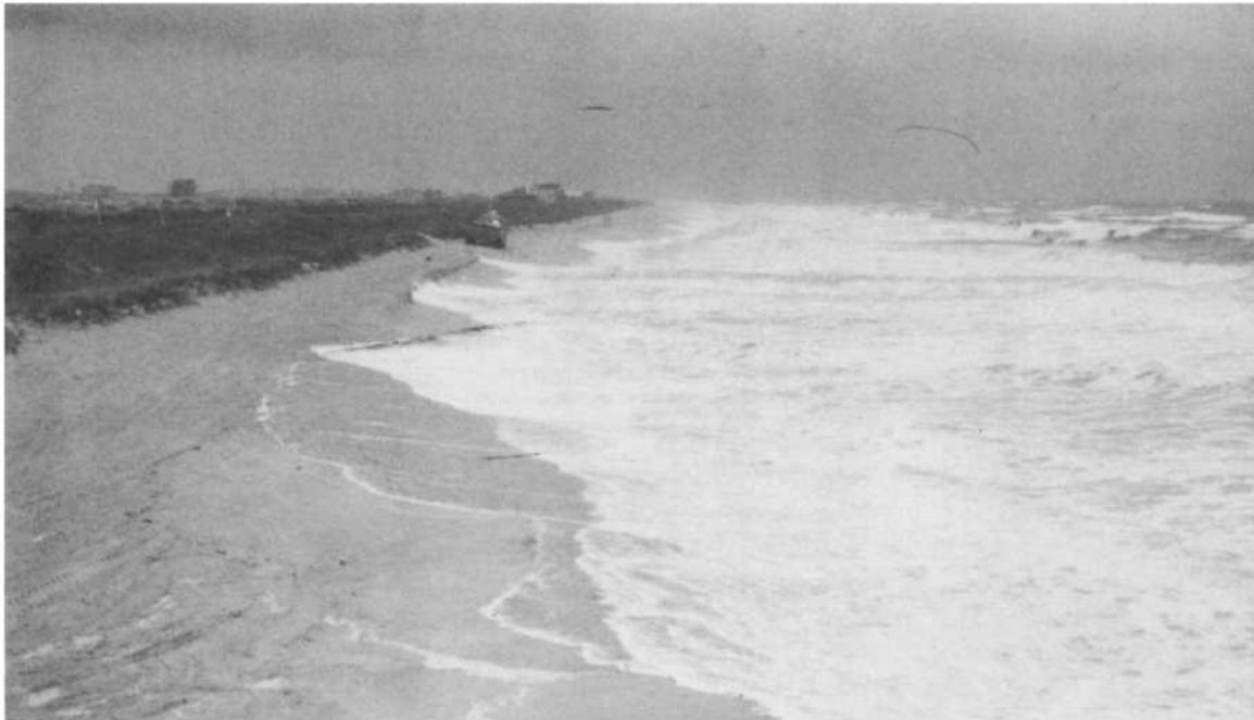
Figure 4-9. Dissipative surf conditions during Storm, Outer Banks, North Carolina

(b) Considering that the objective of most dune stabilization projects is to reduce the frequency of overwash and flooding, barrier island migration is an issue that should be addressed on a case-by-case basis. Though overwash processes have been shown to dominate some narrow barrier islands, most barrier islands appear to be too wide to migrate as a result of overwash. For example, the North Carolina barrier islands have narrowed, not migrated, over the past 130 years (Everts et al. 1983). Beach sands carried by overwash rarely reach the lagoonal side of most barrier islands, though after the barrier island narrows to a critical width, overwash events may contribute to landward migration. Leatherman (1976) determined the critical maximum width for overwash based on an effective transport mechanism on Assateague Island, Maryland, to be between 100 and 200 meters (300 to 600 feet).