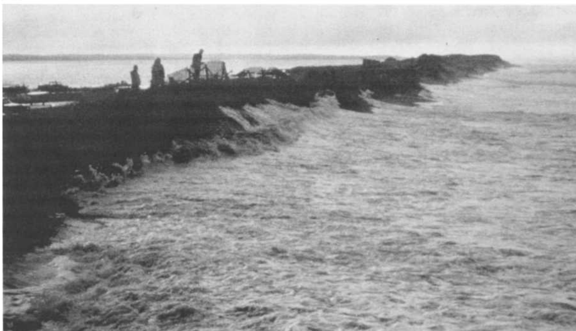
Figure 4-7. Dunes under wave attack, Cape Cod, Massachusetts