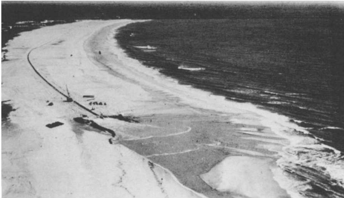
Figure 4-2. Beach nourishment operation, Mayport, Florida

(1) As a wave moves toward shore, it encounters the first beach defense in the form of the sloping nearshore bottom (Figure 4-3; Profile A). Along a gently sloping beach, when the wave reaches a water depth equal to about 1.3 times the wave height, the wave collapses or breaks. Thus, a wave 0.9 meter (3 feet) high will break in a depth of about 1.2 meters (4 feet). If there is an increase in the incoming wave energy, the beach adjusts its profile to facilitate the dissipation of the additional energy. This adjustment is most frequently done by the seaward transport of beach material to an area where the bottom water velocities are sufficiently reduced to cause sediment deposition. Eventually enough material is deposited to form an offshore bar that causes the waves to break farther seaward, widening the surf zone over which the remaining energy must be dissipated. Tides compound the dynamic beach response by constantly changing the elevation at which the water intersects the shore and by providing tidal currents. Thus, the beach is always adjusting to changes in both wave energy and water level.