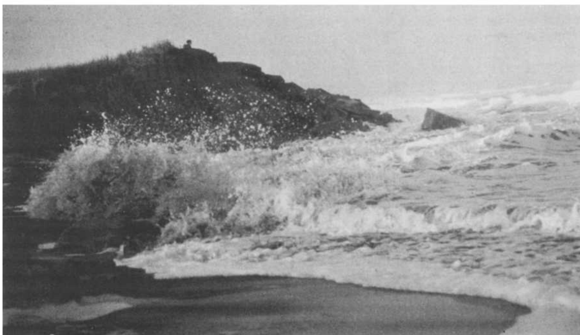
Figure 4-8. Dunes erosion during severe storm, Cape Cod, Massachusetts