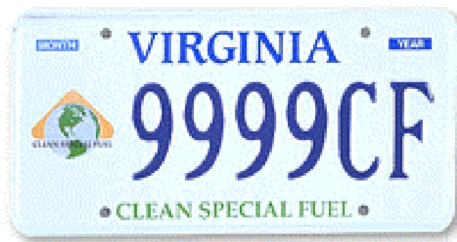
Figure 3. Virginia Clean Special Fuel License Plate.

Only vehicles with clean special fuel license plates are authorized to use the HOV lanes in Virginia without meeting the occupancy requirements. An individual must apply to the Virginia DMV for the special plates. A vehicle owner must submit the application and documentation to the DMV headquarters Special License Plate and Consignment Center. Staff at the Center reviews the application and documentation and determines if the vehicle qualifies for the clean special fuel license plate. The special plates and an invoice are sent to the owner of qualifying vehicles. Figure 3 illustrates the Virginia clean special fuel license plate.