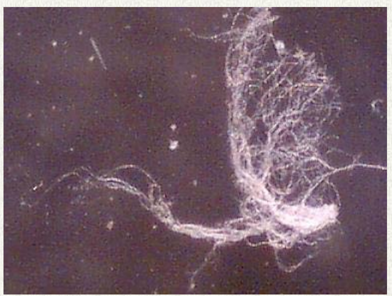
Mycelium of Mold Species #1 at 60x Magnification Septate hyphae are visible under higher magnification.