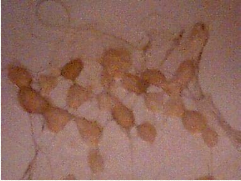
Mold Species #3 at 200x Magnification

The variety of species and coloration of colonies appears to indicate that the major groups of mold types, i.e., Aspergillus, Penicillum, Cladosporium and Rhizopus, are represented. Those knowledgeable in mycology are requested to offer their expertise in this matter.