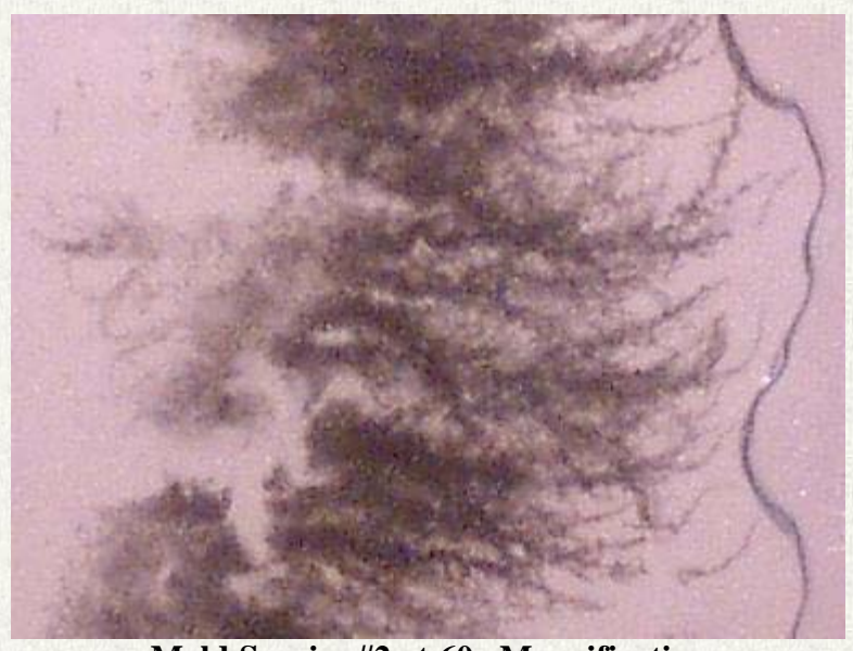
Mold Species #2 at 60x Magnification Conidia are visible under higher magnification. Aspergillus niger under consideration for identification.