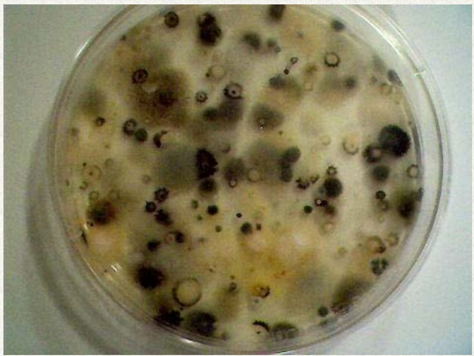
Atmospheric Mold Colonies in Pertri Dish After 96 Hours Incubation Original Exposure Time : 1 hour Sample Collected Outdoors in Rural Santa Fe NM Mar 10 2003 at approx 1400

An atmospheric test specific to mold detection has been conducted. The results appear to indicate a sufficient cause for concern, as a large number of colonies of many species of mold have evolved during the incubation period. The test has been conducted in a dry high desert environment during a period of extended low moisture. Exposure time for the petri dish was one hour. The count of individual colonies easily surpasses 100+ and there appear to be at least 6 different species. Three of these species are shown under higher magnification below. It is hoped that those knowledgeable in mycology will assist in species identification. There is a clear and direct association in the literature between the abundance of mold and respiratory, allergic and asthmatic conditions. Citizens may wish to assess the health implications of these findings, as well as the documented increase that has occurred in the ailments above. It is hoped that additional testing will now begin by citizens in various locations, indoors and outdoors, to assess the extent and nature of this environmental condition. It is not yet known whether this test is representative of the general state of affairs.