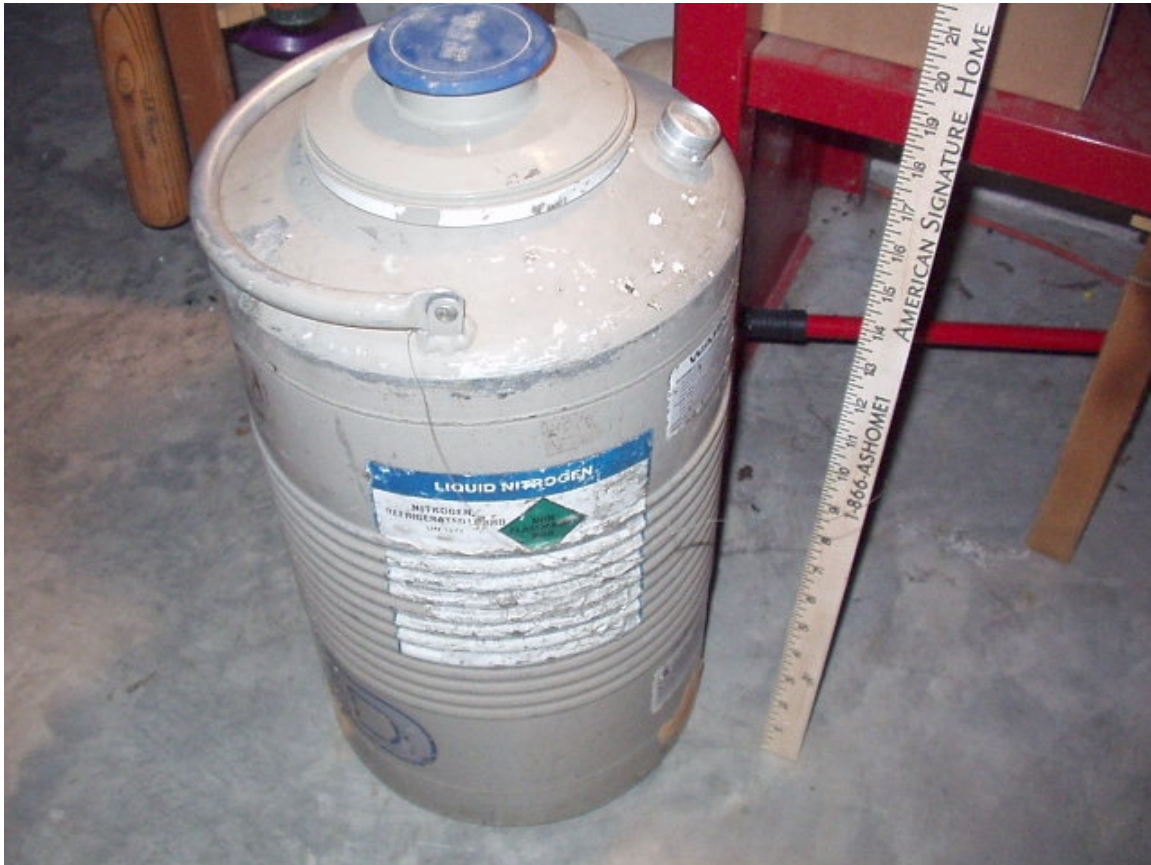
Figure 1. A 10 liter LN2 container from Airgas (931-645-8276) in Clarksville, TN. As the LN2 warms, it changes back into the gas state. The loose fitting top prevents explosion. The LN2 lasts a surprisingly long time (several days) in this type/size container.

With these superconductor kits, you can check the conductance of the YBCO disk with a common continuity meter at room temperature to verify that it is, in fact, an insulator. Once cooled with LN2, you can check the continuity of the YBCO disk again to verify that it has now turned into a conductor. You can also experiment with the unusual characteristics of superconductors such as the Meissner effect and the zero resistance effect.